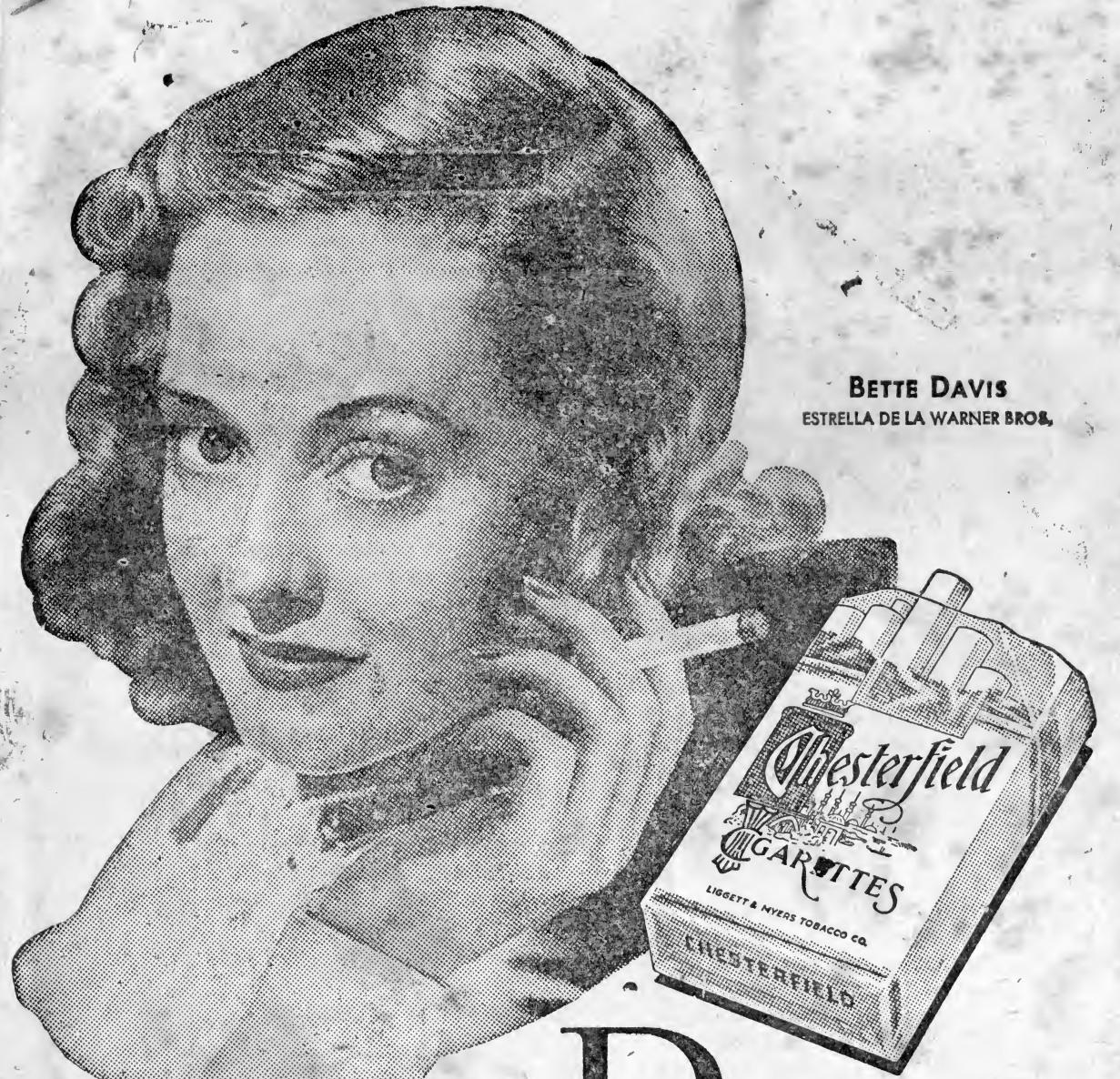
BETTE DAVIS ESTRELLA DE LA WARNER BROS.

Airalarm: Do not stand before a window to see what is going on. A piece of schrapnel (bomb-splinter) might make you pay dearly for your curiosity.